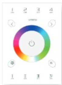
DMX 512 CONTROLLER